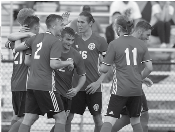
▲ 2018 Viking Men's Soccer celebration < 2018 Viking Women's Soccer goal celebration

Blair Reid Ventsi Stoimirov 515-263-2964 (office) 515-263-6159 (office) 515-554-2902 (cell) vstoimirov@grandview.edu breid@grandview.edu